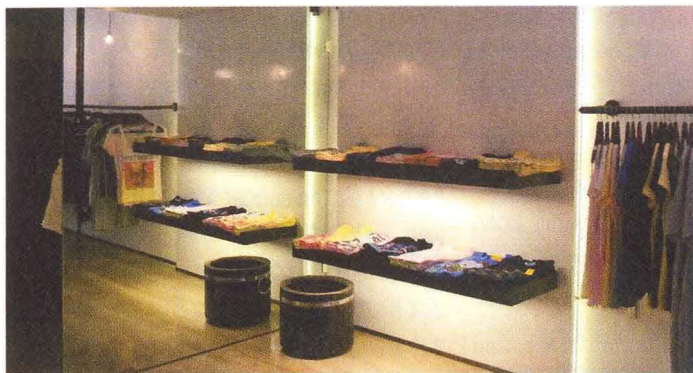
Pandora's box Trunk has some gems for those with hefty pockets

Time Out window-shops at the city's newest stores.