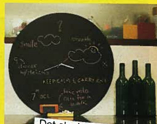
Dot clock, Rs 4,000