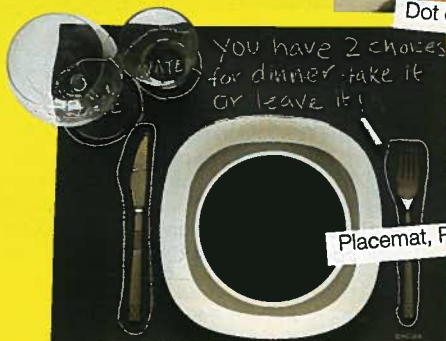
Placemat, Rs 150 each